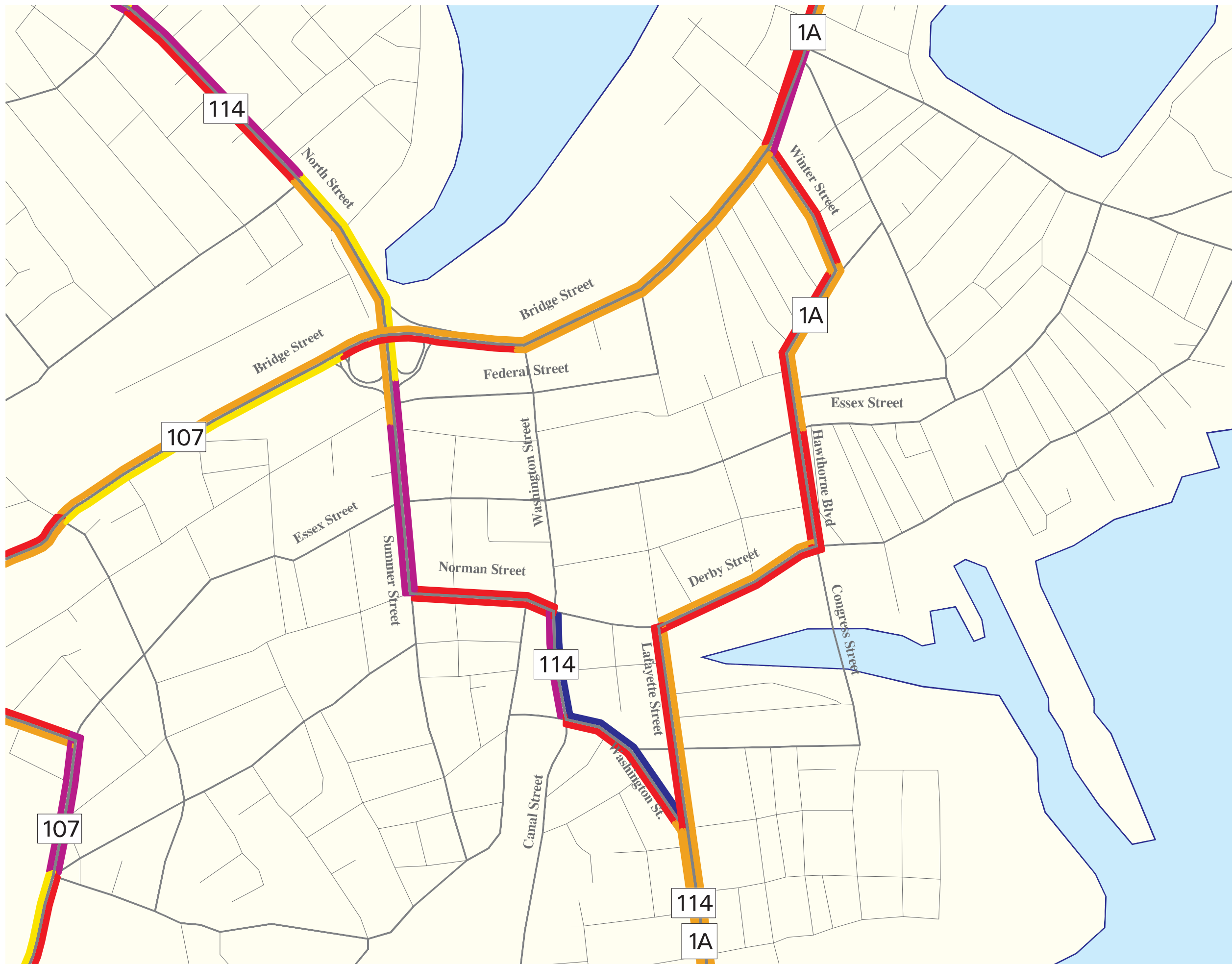
Figure 2-3 AM Peak Period Arterial Travel Speeds