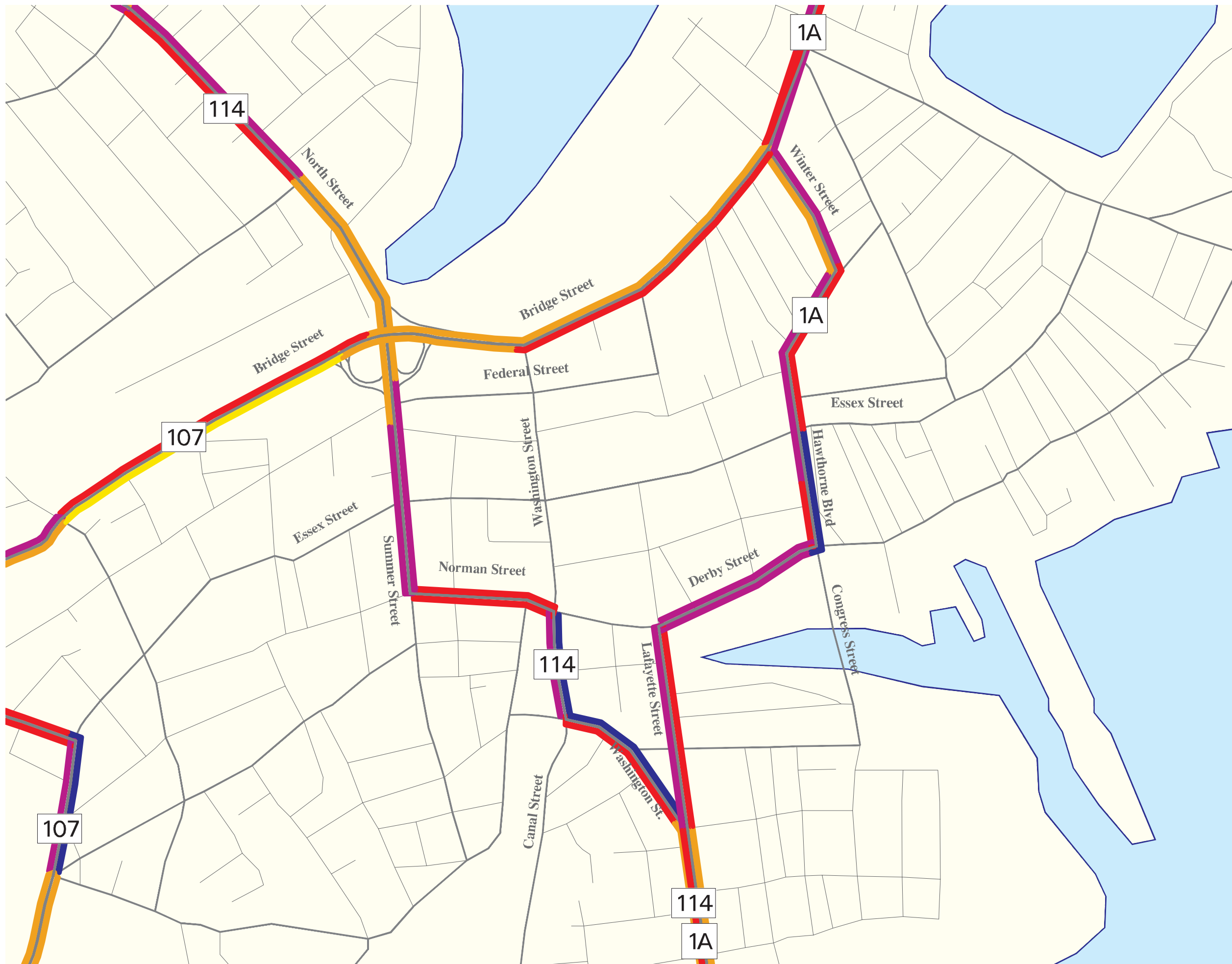
Figure 2-4 PM Peak Period Arterial Travel Speeds