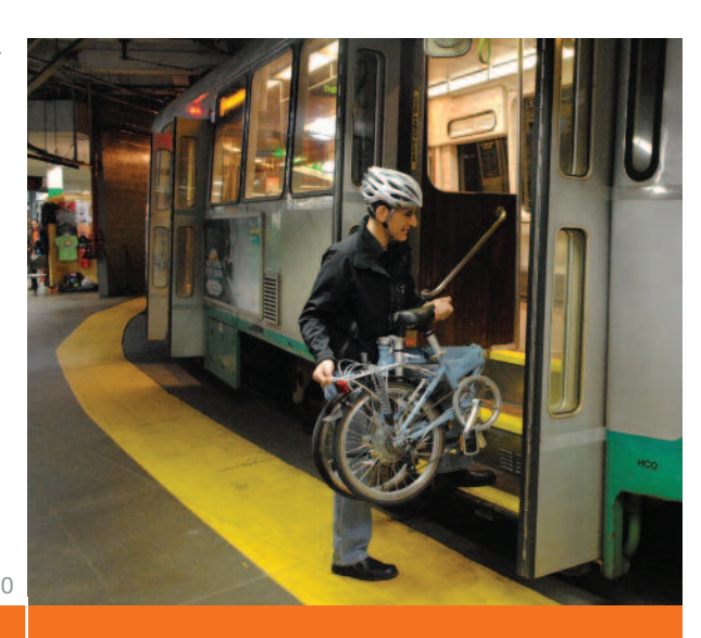
You can bring a folded folding bike on all MBTA vehicles at all times.