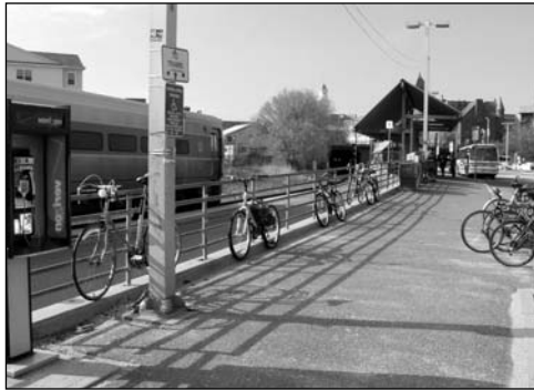
Bicycles at Salem Station

which they are permitted. Previously only two bicycles per entire train were allowed, and only between 10:00 A.M. and 2:00 P.M., and after 7:30 P.M. The new policy allows two bicycles per indi-