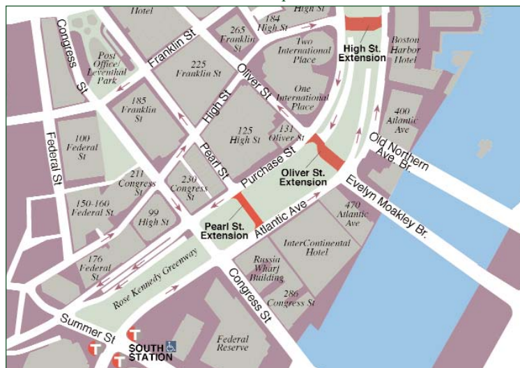
Configuration of High, Pearl, and Oliver streets (extensions shown in red)

traffic flow. The direction of vehicular traffic on High Street in the Financial District between Federal and Purchase streets was reversed on September 30. High Street has also been extended across Purchase Street to Atlantic Avenue, and the segment that was formerly bidirectional from Summer Street to Federal Street is now one-way. These changes are intended to create a more grid-like traffic pattern in the area.