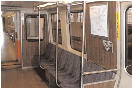
MBTA's upgraded Orange Line car

of a multicolored, wool-like fabric that is woven with thin threads of metal. The material is designed to resist tearing and to be more impervious to graffiti. Each year the MBTA replaces 2,000 or more seats that have been ripped or defaced, at a cost of $18 per cushion.