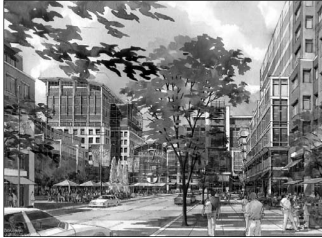
Rendering of future development at Assembly Square

This program has earmarked $22 million to fund the development of new affordable rental housing near transit stations. Planning Assistance for Housing