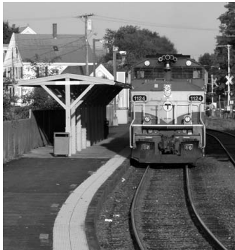
Commuter rail at Gloucester Station