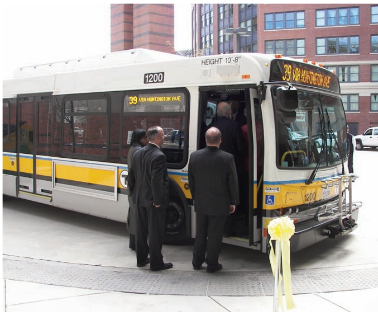
New diesel-hybrid buses went into service on MBTA bus Route #39 in April.