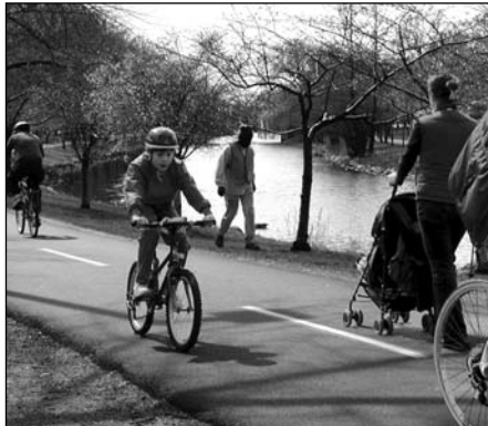
Paul Dudley White Bike Path

(617) 973-7090, or e-mail walkable@ctps.org .