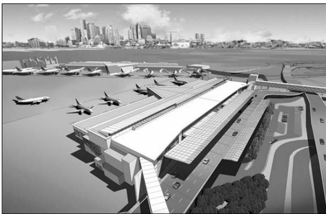
Exterior and interior views of the new Terminal A (artist's rendering)

Expected to be a national model for passenger- and environment-friendly airport facilities, Terminal A is Logan Airport's first truly sustainable, or "green," structure. It is constructed of sustainable