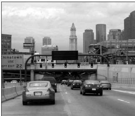
The I-93 southbound tunnel

Over the last 14 months, there was a series of traffic shifts on I-93 southbound as work on the renovation of the former Dewey Square Tunnel continued. With the full opening of I-93 southbound, the highway is now in its permanent