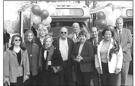
TLC ceremony in Southborough

On March 18 Boston Region MPO members watched with great pride the launch of the first funded project under the MPO's new Suburban Mobility Improvement Program. Operated by the Worcester Regional Transit Authority (WRTA),