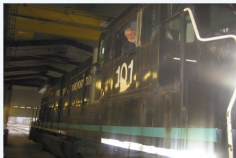
Advisory Council member enjoying a site visit

The Advisory Council did not hold a formal meeting