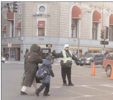
Renaissance School crossing at Arlington Street in Boston